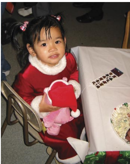
AJ at the Holiday Party